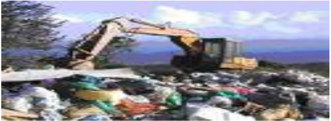
Figure 1 View of SW